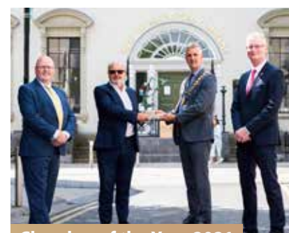
Chamber of the Year 2021