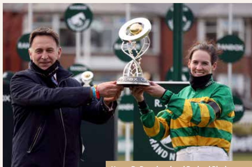
Henry DeBromhead and Rachael Blackmore.